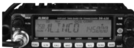
DR-638HE European amateur radio version

※ Peripherals like an antenna, mounting hardware, coax cable etc are required for proper operation.